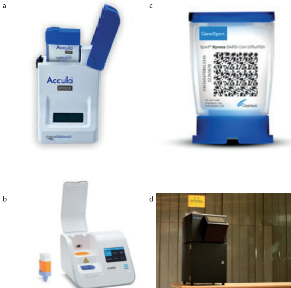
Figure 2. Some examples of currently available devices used in point-of-care diagnostic tests for COVID-19. (a) Fisher Scientific (Mesa Biotech) ACULA Biotech test kit. (b) ABBOTT Laboratories test kit. (c) Cepheid Xpert Xpress SARS-CoV-2/Flu/RSV for use on GeneXpert Xpress system. (d) Abra and TT Electronics Virolens system.

proteins and E or envelope protein (Figure 1). These surface antigens of the virus are copious in either symptomatic or asymptomatic patient samples, such as a nasal or nasopharyngeal swabs or saliva, during viral replication. Most of the current rapid antigen tests detect basic levels of the antigen/s providing only a qualitative 'yes' or 'no' response, similar to a pregnancy test, and do not quantify the viral load in the sample. Currently there are over 100 of these tests, but only a handful are useful for POC testing in a dental clinic.